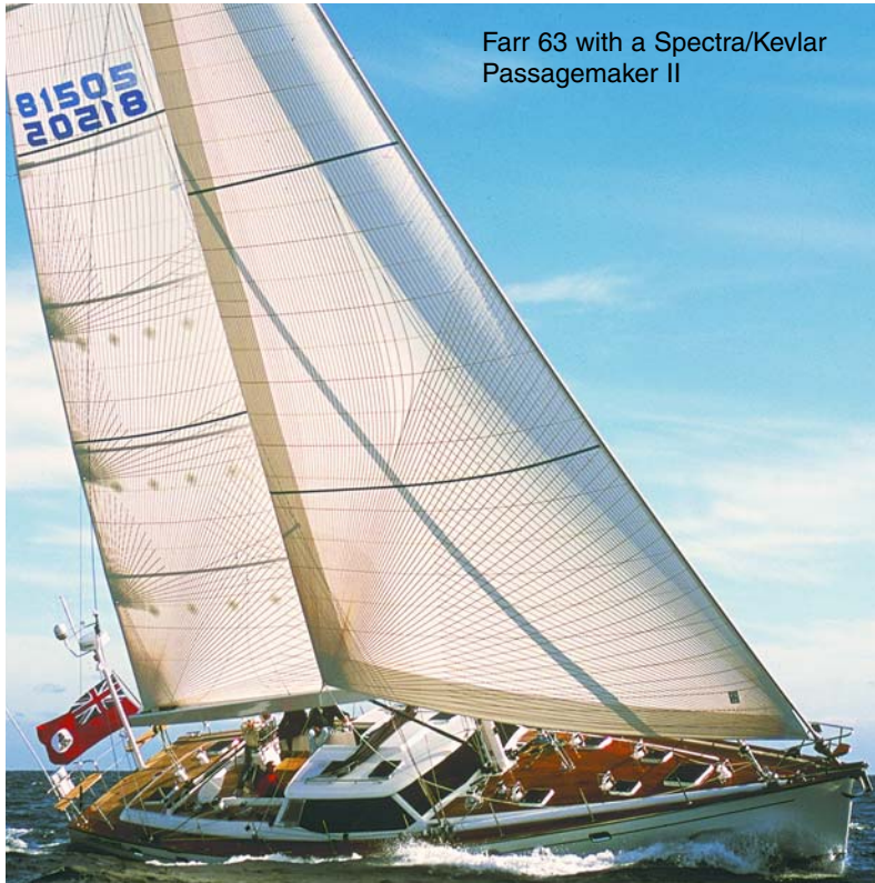
Farr 63 with a Spectra/Kevlar Passagemaker II