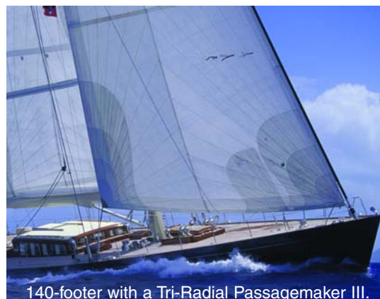
140-footer with a Tri-Radial Passagemaker III.

The Tape-Drive Passagemaker II is ideal for the owner who wants the very best in performance in addition to dependability and durability. Tape-Drive® creates a unique "Rip Stop" layout that prevents accidental tears from becoming catastrophic failures. Damage to the skin fabric migrates only to the nearest tape or seam so tears stay small. As a result,